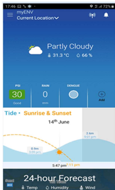
MyENV main page Click on the "bell" icon (top right corner)