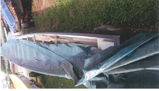
Boat with displaced canvas, to take photo and boat vessel ID