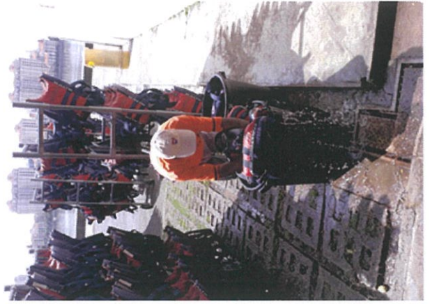
Washing of PFDs (collected from the Nursery and brought to KWSC where there is a water source)