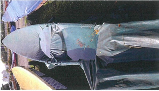
Removal of water from boat canvas and boat under shelter