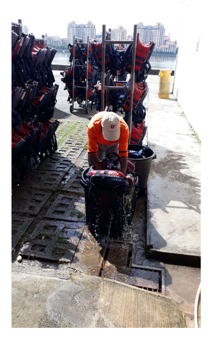
Washing of PFDs at KWSC