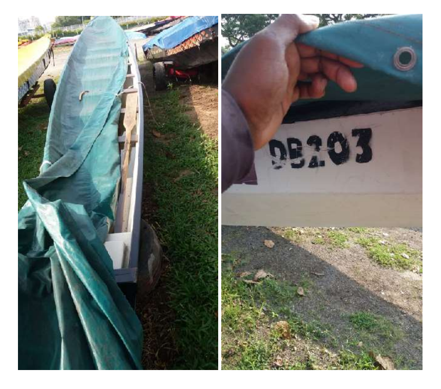
Boat with displaced canvas, to take photo and boat vessel ID