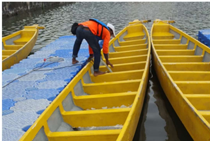
Bailing of water from dragon boats at KWSC